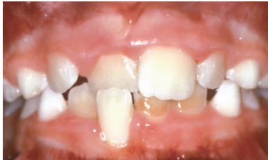
Crossbite of Front Teeth

Malocclusions (“bad bites”) like those illustrated below, may benefit from early diagnosis and referral to an orthodontic specialist for a full evaluation.