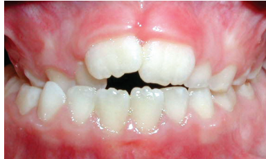
Crossbite of Back Teeth

Top teeth are to the inside of bottom teeth